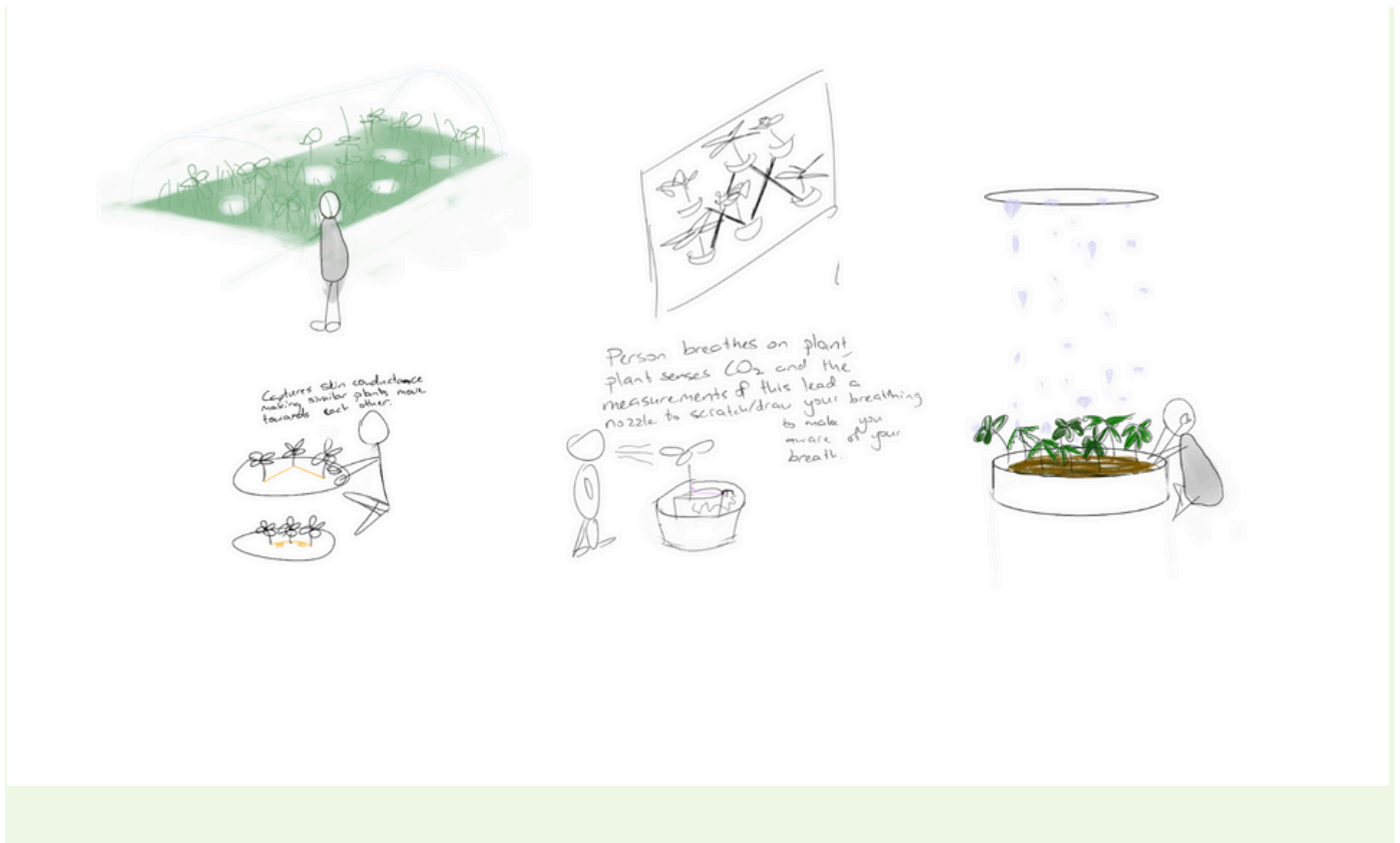
Image 2 Collage of possible opportunities for interaction