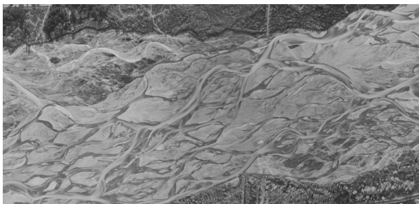
Figure 1: Waimakariri River at Cross-Bank (after Griffiths, 1979) near Christchurch, New Zealand.

To discriminate the effects of sediment grading from other effects, we studied the phenomenon of bar formation and merging using a fully non-linear morphological model based on the Delft3D code ( www.deltares.nl ). In order to represent a real river in the best possible way, the model was set up with the slope, discharge and sediment characteristics of the Waimakariri River in New Zealand (Figure 1).