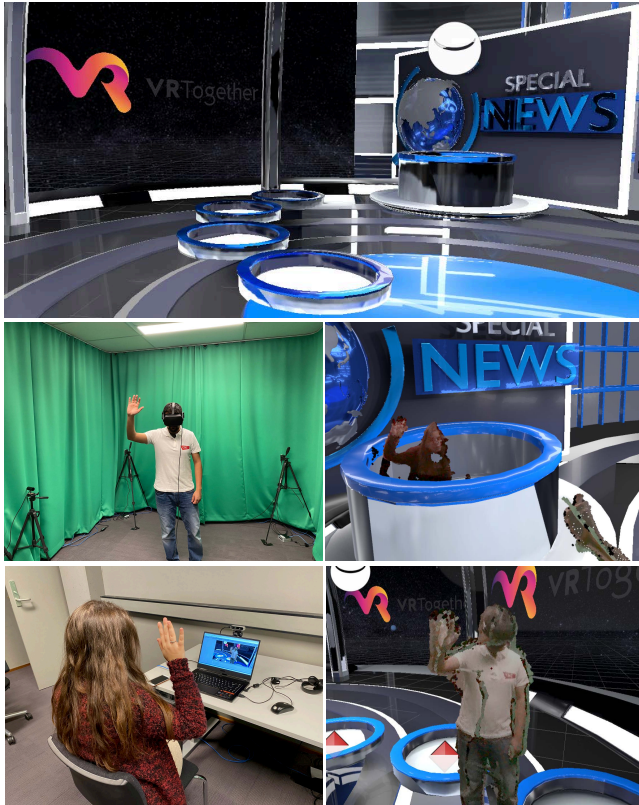
Figure 1: Virtual space, studio setup, portable setup and participant viewpoints