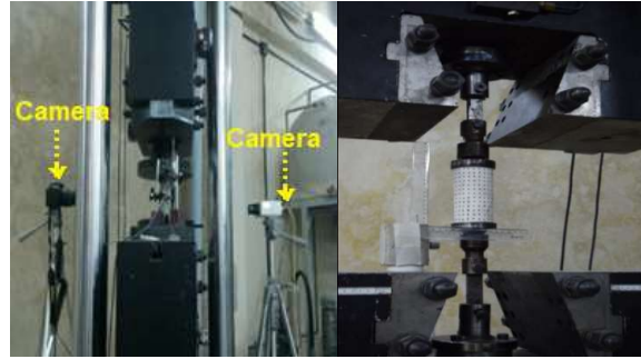
Figure 3 a) DARTEC and cameras configuration b) Dotted Travertine specimen.