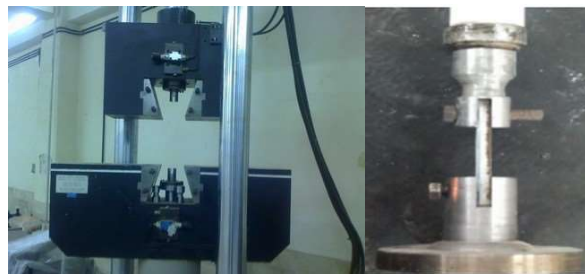
Figure 2 A DARTEC 9600 universal machine (left), The flexural tension jaw (right).

The direct tensile strength tests were performed using a 100-ton universal servo-controlled machine at the rock mechanics laboratory of Amirkabir University. The tests were carried out using specially designed hard steel tension jaws to apply pure tension. The specimens were attached to the steel jaws using resin glue, which also included two flexural hinges to mitigate flexural forces (as shown in Figure 2 ). Note that, this stage and the specimen preparation are coloured blues in Figure 1 . The average tensile strength was found to be 2.62 for Marble and 2.98 for Travertine, indicating that Travertine is harder than Marble. The strength characteristic of these rock types is summarized in Table 1 .