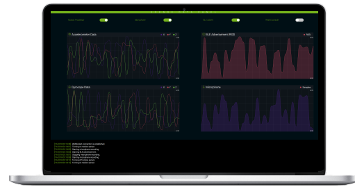
Figure 2: eSense data exploration tool.

Sensing capability of eSense: We will show the sensing capability of eSense with a real-time visualisation tool as illustrated in Figure 2. The four sensor streams (accelerometer data, gyroscope