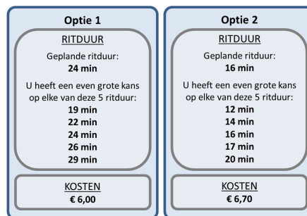
Figure 2: Example of a choice task of the second SP experiment.