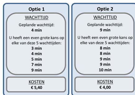
Figure 1: Example of a choice task of the first SP experiment.

Reservations are made real-time (i.e., there is no advanced booking option available). Therefore, the respondent is explained that he/she needs to be ready to depart when booking the ride. Depending of the available vehicles, different waiting times can be expected. The first SP experiment offers respondents two different services (see Figure 1), each one with different waiting time distributions (following the design of Small et al. (1999)). The second SP experiment shows a similar outline, but focusing on in-vehicle time (given the shared nature of DRT, detours to pick up other passengers can lead to varying in-vehicle times for the same ride) (see Figure 2). Therefore, these SP experiments address the variability both in the booking stage and in the in-vehicle stage.