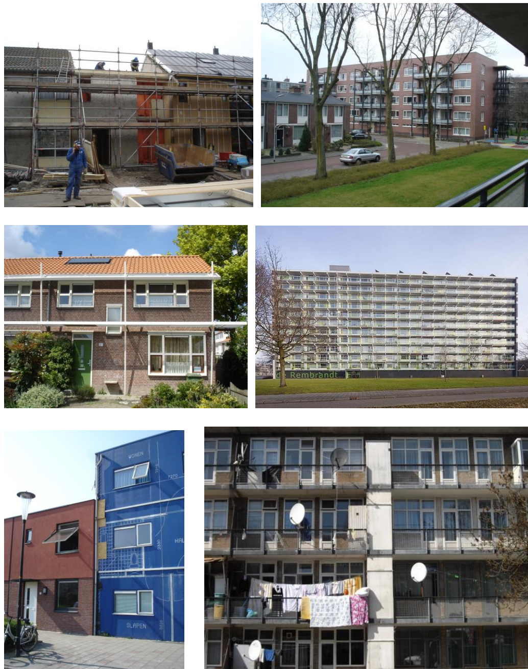
Figure 3: Impression of the six renovation projects.