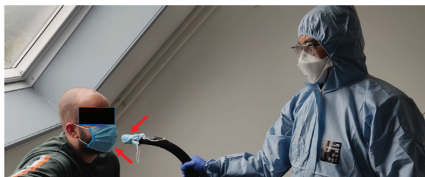
Figure 1. Setting household experiment. Two arrows point towards the face mask that the infected healthcare worker was wearing (with a mouth-shaped area marked in front of the mouth) and the face mask that was used as the sample filter (with the air inlet circle marked).

Both sample filters and face masks (i.e. that were worn by infected HCWs during the home experiments) were analysed for the presence of SARS-CoV-2. In the medical laboratory the marked circle of the sample filters and the marked mouth shapes of the face masks worn by the participants were cut out using scissors. Subsequently, these cut-out pieces were inserted into separate tubes each with 3 mL PCR extraction buffer and incubated for 40 min at room temperature, while during this period samples were also vortexed four times for 1 min. Finally, 500 µL of the extraction was used for RNA extraction