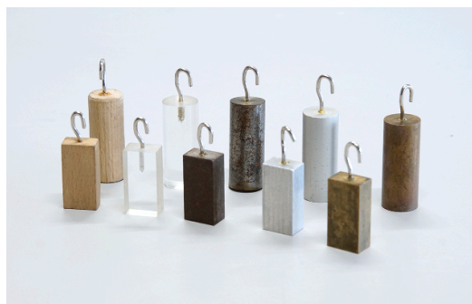
Figure 1. Students would normally spent much time on measuring the mass and volume of each object, where here only a subset of the collection is given.

In our CDC version, each student team is given only a subset of the available materials. Students