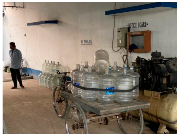
Figure 7. A water-vendor collecting jars at the licensed RO-plant.

In Badai, there are three different sources of drinking water: some households still rely on the traditional hand pumps, others get their water from public stand posts and some buy RO water. A large, government certified bottling plant sells 20-L jars, which are delivered by small, informal vendors, who buy the water from the plant and earn their living from the delivery (Figure 7). Piped water is provided to the stand posts by the Public Health Engineering Department of the West Bengal Government. Untreated groundwater is available here three times a day for one and a half hours. Especially in the summer months respondents reported shortages of domestic water, mainly for those who rely on their own hand pumps, because of ground water depletion.