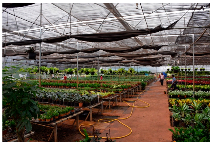
Figure 3. Nursery in Uruli Kanchan.

RO-plants now, are the main source of drinking water for most households in Uruli Kanchan. One NGO has facilitated the implementation of these RO plants, because of a high burden of gastrointestinal diseases. The NGO set up four RO plants, which will be handed over to the gram panchayat in future. For domestic water, each household has a tap connection outside the house, provided by the gram panchayat. Each household receives 50 L of domestic water per capita per day. The water stems from a dam in the Western Ghats, upstream of Pune. There are plans to install a filtration plant to supply piped high-quality drinking water to each household in future. Respondents from the local administration would like to see Uruli Kanchan to be upgraded to a municipality. This would mean an increase in funds, a change in the administrative structure and consequently an increase of services for the citizens, e.g., regarding the provision of water.