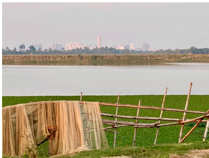
Figure 6. View of the largest tank of the fishing co-operative with a vista of Newtown, a satellite city of Kolkata (photograph by C. Butsch).

domestic purposes. For drinking water most villagers rely on RO water, which is delivered by local water vendors.