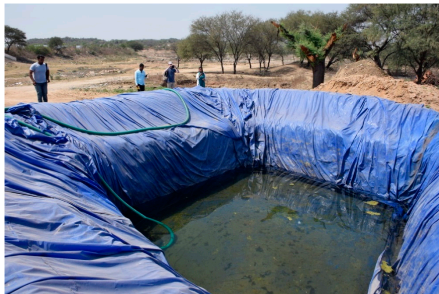
Figure 5. Sump of a water trader (photograph by C. Butsch).

Bowrampet has been severely affected by droughts in the last years prior to our visit. Respondents describe a decline of available water. Surface water was until the 1980s the primary source of water for the village. Three larger artificial storages and two smaller ones were sufficient to secure the water for livelihoods like farming and fishing. In the 1980s, the villagers shifted to groundwater as main source of water, as it was initially available round the year and because the demand for water was rising (new cropping patterns, increasing population). The groundwater level has fallen quickly from 150 feet in the 1980s to 1000 feet (only these deep borewells provide water constantly). Older farmers said that the groundwater level fell more quickly after 2006, due to the development initiated in this area by the ORR project (finalized in 2010). But the groundwater is not only used locally: we observed a lot of water tankers delivering water to the city—and groundwater fed filling stations for them (Figure 5). Thus, the Bowrampet's groundwater has been commodified and became an export good, which is more remunerative than selling vegetables or fish.