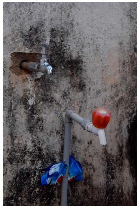
Figure 4. Two parallel supply systems—two water taps per household.

The water supply to households was in a transformative stage during our visit. Under the "Mission Bhagiratha" Telangana state aims at providing 100 L of piped treated drinking water to households in rural areas [118]. In March 2019, the pipelines were being laid in the village, but there was no water in the pipes yet. Thus, the population was still relying on the supply from the gram panchayat, sourced from the local tank. Each household got two hours of water supply on every second day. The water has to be stored by each household individually, so one finds plastic barrels and other storage facilities in front of almost every house. Parallel to that, there is a drinking water supply, delivering treated water from river Krishna to public standposts. Water is available here between one to two hours daily. Thus, for households two parallel water supply infrastructures are in place and a third is in the making (Figure 4).