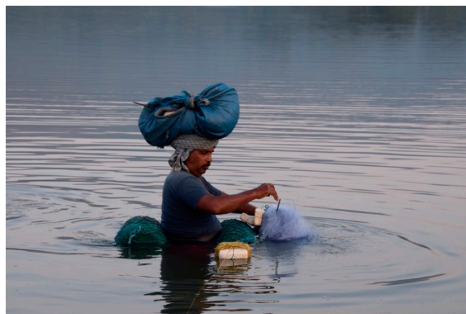
Figure 2. Fisherman in Paud.

There are three traditional water-based livelihoods, which are affected by periurbanisation: fishing, farming, and pottery. Members of the fishing community (Figure 2) highlighted how their livelihoods have changed, as their access to water bodies was restricted. Especially accessing the dams in the Western Ghats has become difficult, as the government decided to auction the right to fish in the dams. As the fishermen cannot pay the same prices as financially potent outsiders, they were excluded from some of their traditional fishing grounds. Now they have to travel longer distances for fishing and their income is stable or decreasing. These institutional changes result in skepticism regarding the sustainability of their livelihood on side of the fishermen.