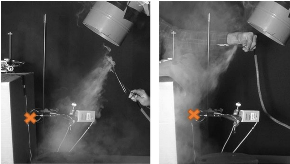
Figure 3. Visualization of the air stream caused by the PV system. Left: smoke supplied from the front, Right: smoke supplied from the back. Orange cross: breathing zone.

PV-system was applied. The ratio is determined by dividing the average particle concentration with PV system by the average particle concentration without the PV system.