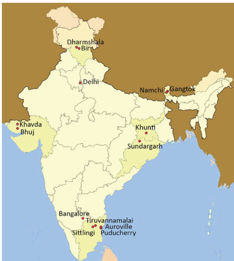
Fig. 10.1 Map of India marked with interview locations

based on their geographic location and climatic diversity. Recommendations on locations from experts were also taken into account. Forty per cent of the interviews were conducted in the rural areas of south India.