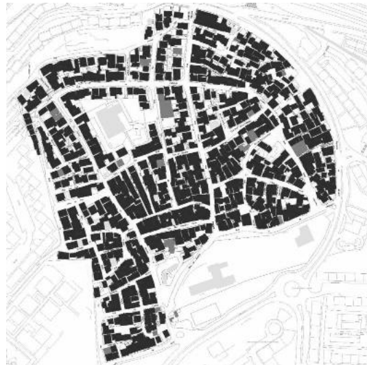
Figure 3: Dwellings

The use of a GIS tool in conjunction with the database built with data from the survey allowed for mapping the different parameters (e.g. building uses - Figure 3 -, main defects, severity of defects).