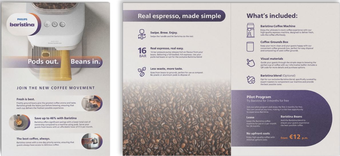
Figure 48: Leaflet for direct contact with hotels in Horizon 1

The leaflet is designed to be used by the sales team during meetings with hotel managers, particularly during the initial pilot phase targeting smaller hotels. The leaflet highlights the main benefits of Baristina - its fresh bean solution, high-quality coffee, cost-effectiveness, priority servicing, and zero waste. It is structured to provide a clear and compelling narrative about why Baristina is a great choice for in-room coffee solutions. The leaflet includes sections on the features, what is included in the package, and the cost, offering a transparent and straightforward overview for potential clients.