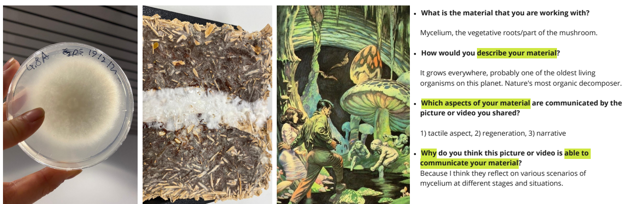
Figure 4. Examples from participants' Miro board. Left: Representative pictures for mycelium sent by the participant. Right: The same participant's answers to the first group of questions in the study.

For the second group of questions, we utilized the interpretive and affective vocabulary set provided by the experiential characterization toolkit (presented earlier in Section 2) as stimuli to trigger discussions relevant to interpretive and affective levels of experiential