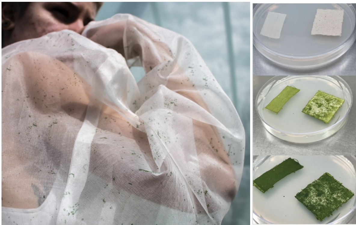
Figure 1. Biogarmentry by Roya Aghighi. The color of the textile changes over time as a result of growth and death of the microalgae.

being alive’ (p. 13). Such unique forms of interactions between living materials and humans can lead to care (Karana et al., 2020), and empathy for artefacts in use (Cheok et.al., 2008). For example, Rafigh (Hamidi & Baljko, 2014), a living media interface, utilizes the care, responsibility, and empathy feelings elicited by living beings (Wilson, 1991) to motivate children involving repetitive and sometimes boring tasks. The well-being of the living organism and its growth facilitates engagement and interest of children as a form of alternative reward mechanism of the interface (Hamidi & Baljko, 2017). In another living artefact, Biogarmentry, the designer Roya Aghighi envisions a photosynthetic living garment that can purify air around the user and illustrates unique living aesthetics as a result of growth and death of habituated algae (Figure 2). This living textile requires people to perform novel care actions different than those for conventional textiles.