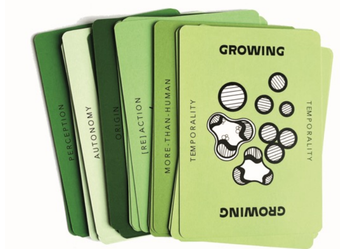
Figure 6. “Miraculous Futures for Living Materials” speculative storytelling card deck by Affect Lab (2021). This card deck is designed by incorporating the Living Materials Vocabulary and the themes mentioned section 4.2.