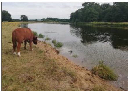
Figure 1. Nature-friendly bank near Varsen on 12-7-2022

We would like to express sincere gratitude to the staff of water boards Vechtstromen and Drents Overijsselse Delta for their input and helpful feedback during the study.