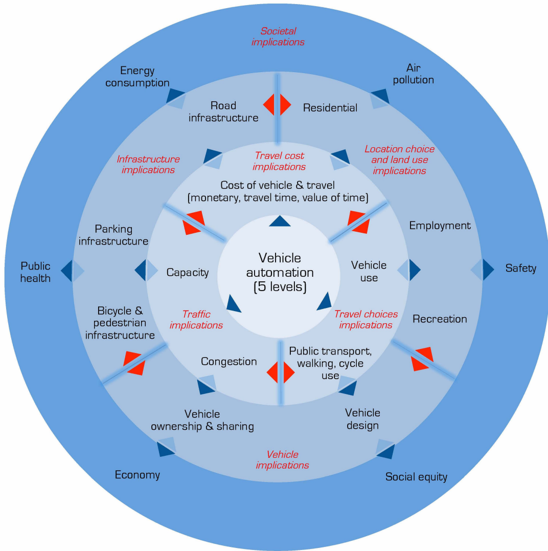
Figure 1: The ripple effect of automated driving.