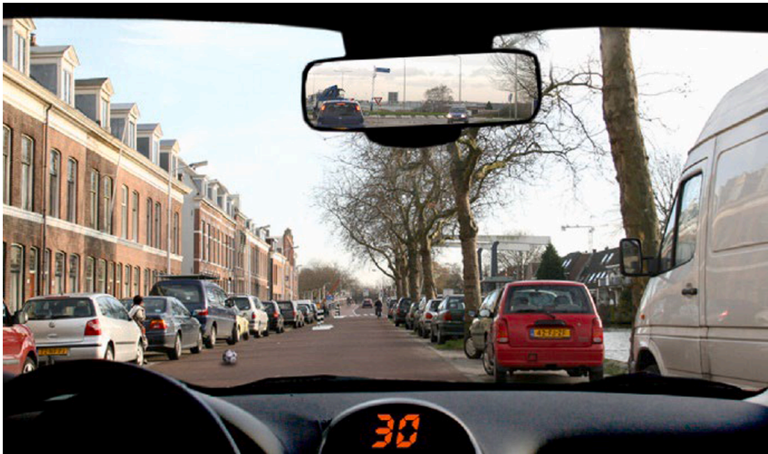
Fig. A1. First scenario for preparatory survey version A. Caption shown to participants: “Driving in the inner city at 30 km/h”. The hazard in this scenario concerns a child located between two parked cars, who may attempt to retrieve a football on the street. . Reprinted with permission. Source: Vlakveld (2011)