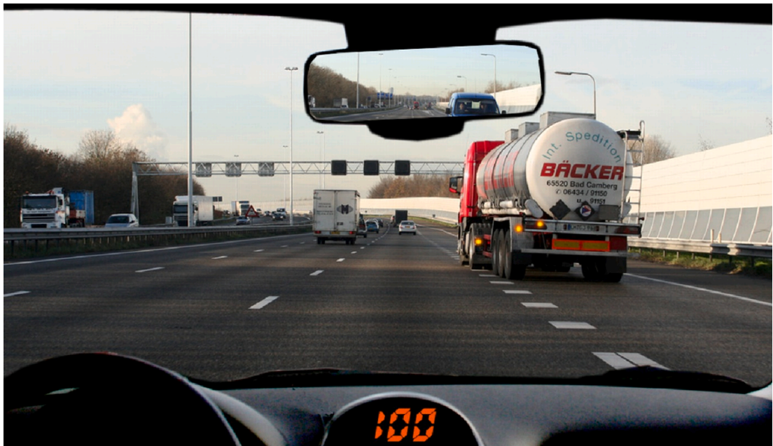
Fig. A2. Second scenario for preparatory survey version A. Caption shown to participants: “Driving on the highway at 100 km/h”. The hazard in this scenario concerns a speed differential with a truck intending to merge. In the Netherlands the maximum allowed speed for trucks is 80 km/h. .

One method of ranking SA requirements suggested during the interviews is the use of expert drivers. Asking expert drivers to rank the selected requirements based on importance to safety would result in the relative importance of requirements. However, experienced drivers are not always capable of explaining why certain elements should be considered more important than others and show