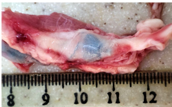
Figure 2: The gross pathological image illustrates the Iranian occluder securely positioned within the femoral artery, even though it was oversized for this vessel. The device appears stable and embedded without causing thrombosis in the proximal and distal parts of the artery.

This inflammatory response is a typical reaction to a foreign implant and is consistent with normal healing processes. Additionally, varying degrees of neointimal formation and reendothelialization were observed around the occluder mesh, indicating the initiation of tissue incorporation. Importantly, no significant thrombus formation, vessel wall injury, or granuloma formation was observed in any tissue sample. These findings