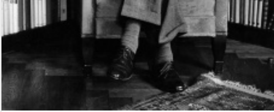
Karl Jaspers

argues, because his approach was intrinsically bound to the world and the people in it.