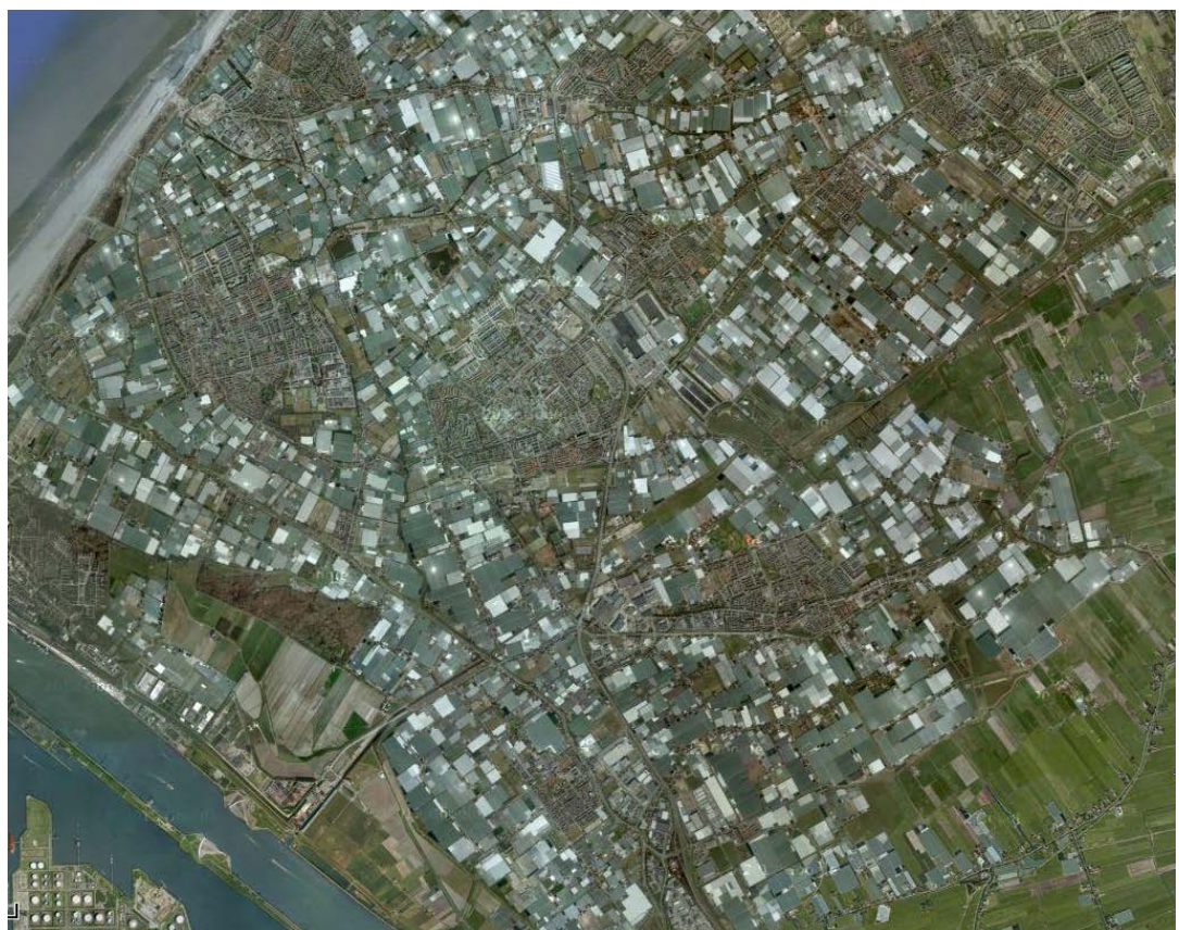
Figure 2. Satellite photo of the Westland area (website Google Maps, 2012)

In the case study analysis in Section 4, and in the presentation of gained insights in Section 5, we have included some quotes from the interviews with the greenhouse growers to support our findings. These quotes are written in italic.