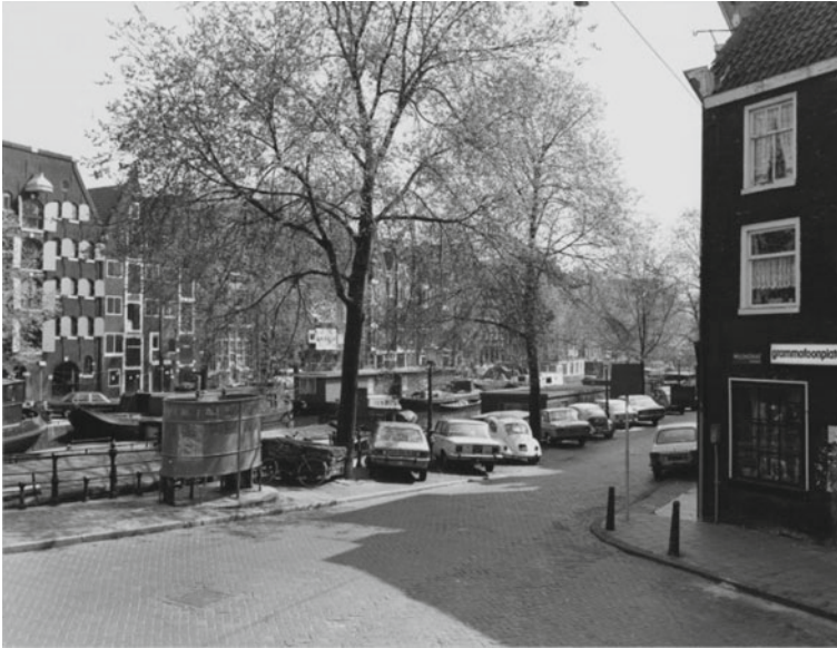
Fig. 1 Historical image from the Beeldbank database depicting a street corner in the centre of Amsterdam [24]

national importance, like cadastral information. After that we can easily look up all relevant information about buildings, for example the intended function, its floor-plan, age, address, neighbourhoods, etc. Every image in the beeldbank database has meta-data containing information about the type of figure (e.g. drawing, map, photo, author, date, title, description).