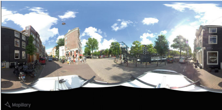
Fig. 2 Street view image retrieved via the Mapillary API for a given radius and geo-coordinate [28]