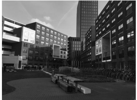
NEW HOUSING DEVELOPMENTS

The research done about the “2050-aspect” of the program and society opens up new possibilities concerning design. In terms of library design a clear shift from the traditional library focusing on collection towards a focus on creation and unfoldment of the individual. In this way people gets in touch with new technologies and transfer knowledge about this. The building should also provide for spaces to be inspired and exhibit the created,. In terms of design this expresses itself in a focus on makerspaces and exhibition spaces instead of the traditional reading spaces and archive. For the building type of a metro station there is a shift from mono-functional transfer hub towards a more elaborated complex with spaces for small and easy accessible commerce and space for culture. Besides, there is an increasing focus on public transport, increasing the people flows it should be able to serve.