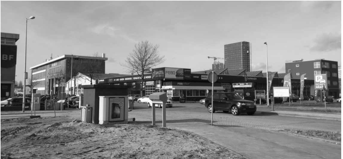
INDUSTRY AND LOW VALUE COMMERCE AT OVERAMSTEL

the design should meet. This method was important to integrate in my personal design process, especially to understand the broader context of current processes going on in Amsterdam and prognoses of developments until 2050. Because of this, it was possible to design a building which functions on the one side as an efficient junction in the infrastructure, but on the other side creates new attractive public space, creating a new center for a new neighborhood in the urban fabric of Amsterdam.