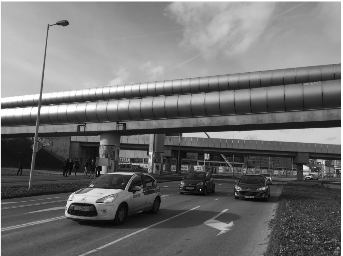
LARGE SCALE INFRASTRUCTURE ON SITE

The main goal of this project is to create inclusive connections between different people, program, infrastructure and fragmented blocks in one new center to the site. It consists out of a metro station combined with a library. The building is situated on two clear axes, the metro tracks and a perpendicular pedestrian connection below. The library above this crossing is shaped as a square, creating a fitting balance between both of the axes. This clarity in shape causes it to be on the one hand a humble, but on the other hand recognizable form. In the middle of the volume a circle is carved out of the volume to have clear visual connections from the library with both connections below, bounding the different program parts together.