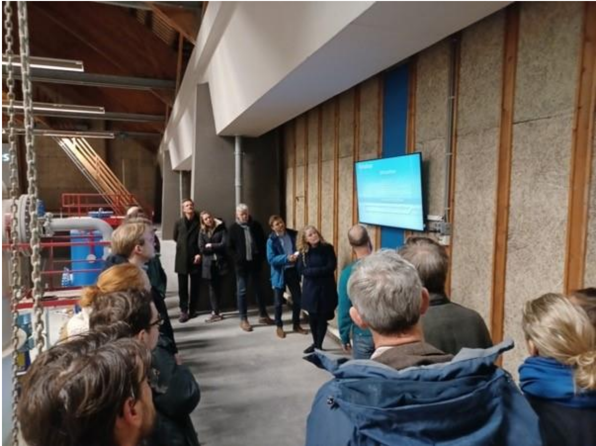
Visit to the Deltares water lab during the first day of the sandpit.

Starting in disciplinary groups to discuss these challenges, the practical experience from professionals in the field was gathered and used to build a preliminary understanding of the design-challenge(s) at hand, to further define the design brief and preliminary proposition.