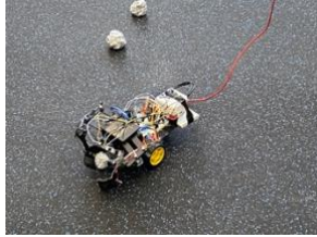
a) Active Learning: Making your own Trash Sorting robot, 2 nd year BSc

the appropriate level), socialisation (being able to think critically across cultural and societal contexts by working together in diverse classrooms) and subjectification (teaching students to take responsibility for their choices). The MIRTE Pioneer is currently extensively used in BSc programmes in our institution and beyond, with over 300 MIRTE Pioneers being built and used by our BSc students each year.