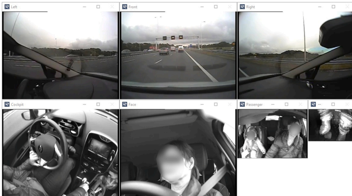
Fig. 1. Views of seven video cameras in the UDRIVE data when encountering an active VSL: road front left, road front centre, road front right, vehicle cockpit, face of the driver, vehicle cabin, and feet of the driver. The face of the driver and of the passenger have been blurred due to privacy reasons.

km/h VSL with flashing lights (hereafter: 50-flashing VSL [*50*]) and 50 km/h VSL (hereafter: 50 VSL [50]). The VSLs are lane specific and different VSLs can be active simultaneously on the same gantry. To understand whether the driver is subject to an AID sequence, the driving lane is needed. Given that the driving lane is not available in the UDRIVE database, the events were initially selected including all situations in which the AID sequence was active in at least one lane. A prerequisite for event selection was that three different physical gantries were passed by the driver. The gantry states are updated when the loops detect that congestion has moved upstream or downstream. Therefore, the gantry states might have been updated while the driver was passing through the AID sequence. The driver might have seen the 70-flashing VSL on the first gantry and the 50-flashing VSL being substituted by the 50 VSL on the second gantry. Events including such state changes were removed from subsequent analysis.