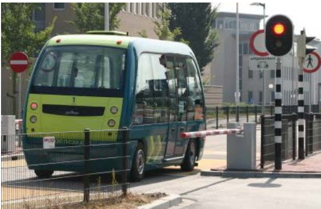
Figure 2: The Rivium ParkShuttle in operation (11)

The ParkShuttle operates on a designated lane. The designated lane is two-lane, except the overpass over the Abraham van Rijckevorselweg and the tunnel near the metro station. The lane was initially designed as a bicycle lane, hence the one-way viaduct and tunnel. Crossing traffic is managed with barriers (see figure 1). Because the vehicle is operating on a designated lane, there is minimal disturbance of other traffic (10).