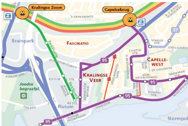
Figure 3: Public transport at Rivium (the ParkShuttle is the green line) (12)

The Frog system is integrated in the infrastructure which means the asphalt contains artificial landmarks (magnets) to help the vehicles navigate. There is a magnet every four meter. The route is 1800 meters and contains five stops. See figure 2 for the route of the vehicles.