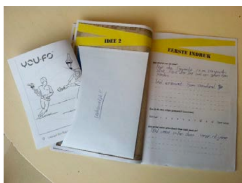
Figure.3 Two pages from the Research Booklet

During the preparation, the co-researchers were instructed on how to perform the interviews and received voice-recorders and two research booklets. The purpose of the booklet was to guide the co-researcher in the course of the interviews by explaining the aim of the research, giving interviewing tips and providing structured questions. During the interviews the co-researcher wrote down the answers to the questions in the booklets. The booklet started with questions about the relationship of the co-researcher and his/her participant, followed by the explanation of the 5 concepts on pages placed in envelopes on the left, and questions about the concept designs on the right pages (figure 3). The booklet ended with assignments requiring a comparison of the concept designs, such as “Put the concepts in order of preference”, “Which one fits you best and why?” or “Which one do you think others like best and why?”