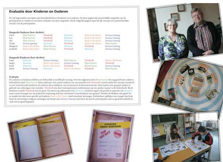
Figure.2 Evaluation reports given to juries

In two of the cities that participate in the ProFit project, Delft and Eindhoven (The Netherlands), the submitted design concepts were evaluated with co-researchers from the FieldLab target groups. These co-researchers performed interviews with peers to gather more opinions and to ground their own opinion. These opinions were input for juries (figure 2), to help them decide the winning concepts, which will be placed in the FieldLabs.