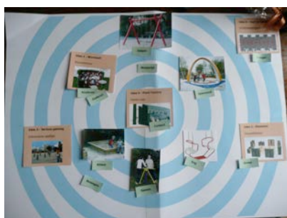
Figure.4 Bulls-eye with concept and words

Each co-researcher conducted interviews with two peers. After 1 or 2 weeks the co-researchers came together with the researcher for a feedback session in which they reported about the interviews and arranged all concepts around a bulls-eye to express their order of attractiveness. Subsequently they were given some words, abstracted from a contextual user research, which had been conducted before the competition. The co-researchers pasted the different words on the concepts of their choice and explained their reasoning (figure 4). The opinions and reactions of the co-researchers and participants on the concepts were gathered and combined into an overview that was presented to the FieldLab juries in Delft and Eindhoven (figure 2).