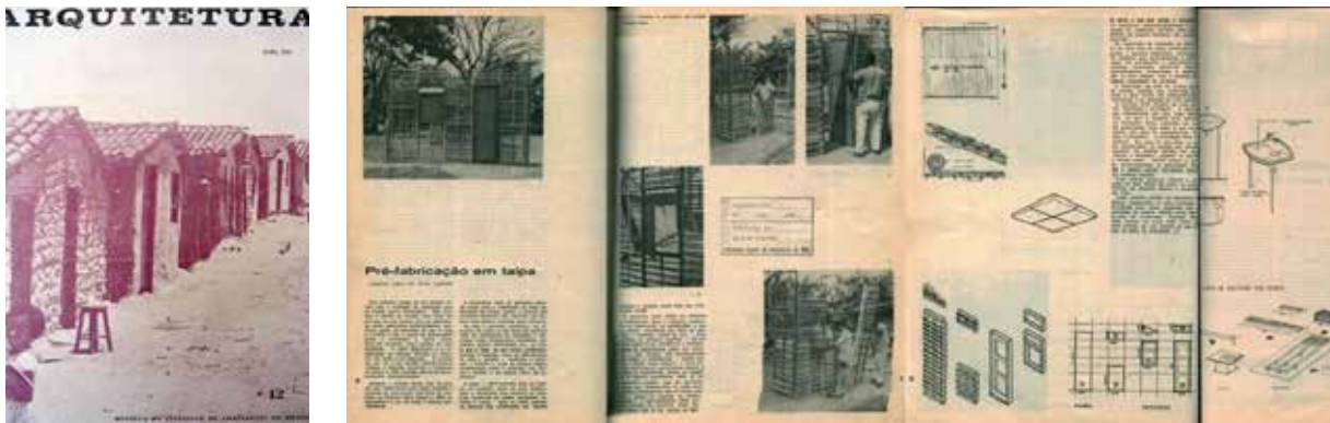
FIGURE 6 Image of a project designed by the Liga Social contra o Mocambo in Recife.

Up until the 1980s, planning for social housing still favoured the privileged working class, denying low-income workers or so-called illegal workers. For example, in social housing complexes throughout the whole country it is common to find a room for a maid, indicating that aristocratic sense and values with which they were designed. However, contemporary to this period, a number of alternative sectors of society united to conduct participatory planning, such as the Liga Social contra o Mocambo (Figure 6), and Mutiroes .