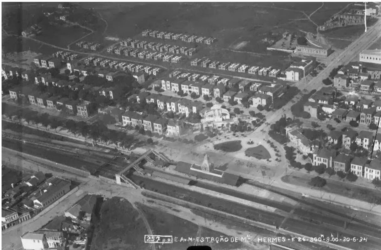
FIGURE 2 Rio de Janeiro, Villa Marechal Hermes 1922 – picture shows the houses of workers of an industry. They were usually isolated or geminated casas. Often there was a cinema, a theater a children nursery, a clinique, a sports center, churches, gas station. All these facilities stimulated the inhabitants to stay in the Villa.