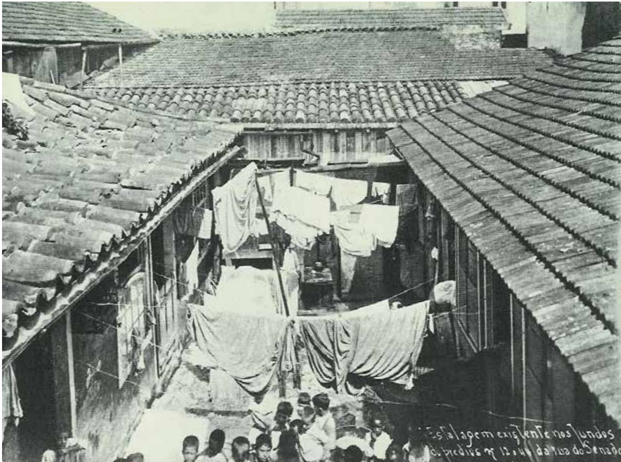
FIGURE 3 Cortiço, Rio de Janeiro: a multifamily housing housing where families shared collective spaces such as clothes line and a central courtyard. Brazilian independent workers of the post abolition period usually lived in these spaces.

At this time, numerous property owners invested in cheap housing blocks with no sewage connection. These hives, the so-called corticós 5 (Figure 3), usually consisted of several rooms connected by corridors and an atrium where recreational and social events could take place. Artists, free workers, free slaves, informal workers and immigrants sought this kind of housing. In contrast to the villas, everyday activities happened in the reduced space of the room, overloading multiple space functions or having to meddle with the neighbor's room for several reasons deriving from the lack of space or insalubrity. Furthermore, with housing being an exclusive commodity, inhabitants often came across constant rent increases, often having to move elsewhere. Consequently, some people began occupying land illegally in the outskirts of the city.