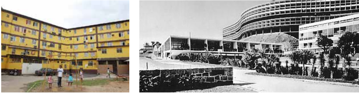
FIGURE 5 Rio de Janeiro, Social Housing for the privileged workers 'Amarelinho' (inhabitants are removed people from a favela). Pedregulho Social Housing for the Privileged workers ( inhabitants were state workers – from cleaning service workers to secretaries and technicians of the government).