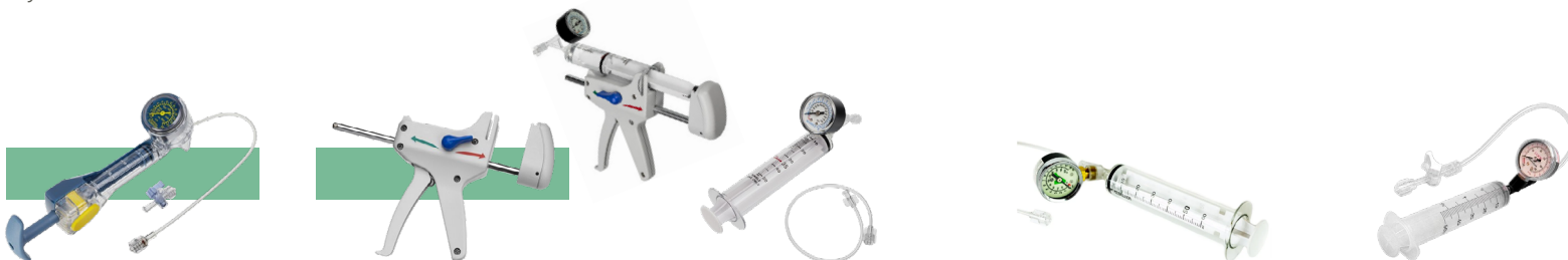
Table 10. Inflators analysed. Highlighted in yellow, the devices specified for angioplasty. Highlighted in green, the devices analysed in this assessment.