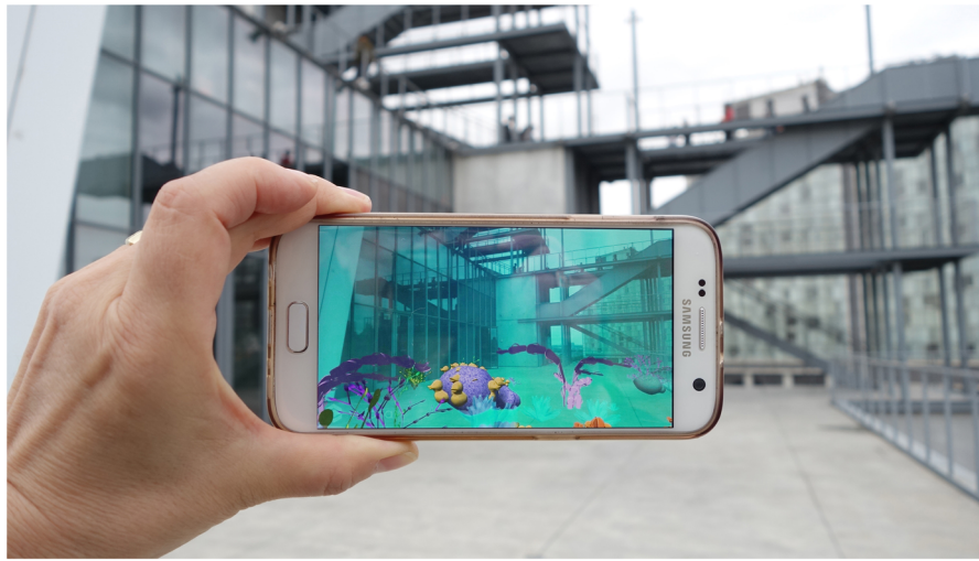
Figure 1. "Unexpected Growth" augmented reality installation by Tamiko Thiel and /p, 2018. Commissioned by and in the collection of the Whitney Museum of American Art, New York.

become who and what they are in and through their relations with others. We are relational all the way down, and in this we are not much different from a range of small and large entities – from microorganisms and fungi to trees and the planet as a whole (Margulis and Sagan 1997).