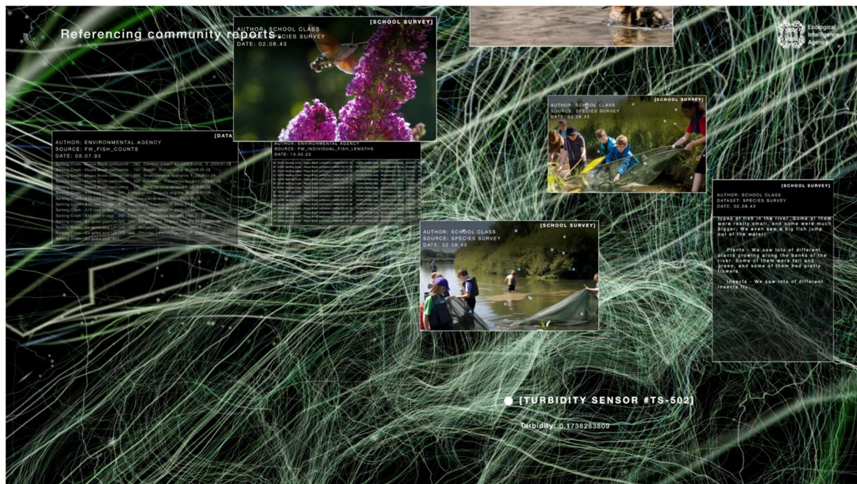
Figure 2. The Ecological Intelligence Agency by Superflux. Source: Superflux 2024

unlimited access to knowledge systems, does not assume only one way to understand the world, and does not perpetuate dominant extractive paradigms....an intelligence that is accountable and accounts for a multitude of interconnected cosmologies and lived-experiences alongside data sets. (Superflux 2024).