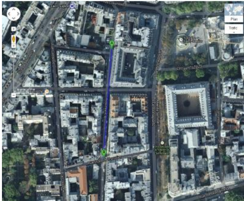
Figure 2: Rue Madame, Paris (France). Orthophoto from IGN-Google Maps.

We use a benchmark dataset created by Serna et al. (2011), which consists of two PLY files with 10 million points each. To each point (X, Y, Z) coordinates, reflectance value, label and class have been assigned. There are 26 classes. We use one PLY file, i.e. 10 million points, and choose five classes: pedestrians, motorcycles, traffic signs, trash cans and fast pedestrians. The selection is based on the similar amount of points (around 10,000) reflected on each object surface. Figure 2 shows an orthophoto of the test site. In our tentative test we assume that street level is everywhere the same, i.e. the points at street level do have the same height. So, we use the original height values (Z) as feature.