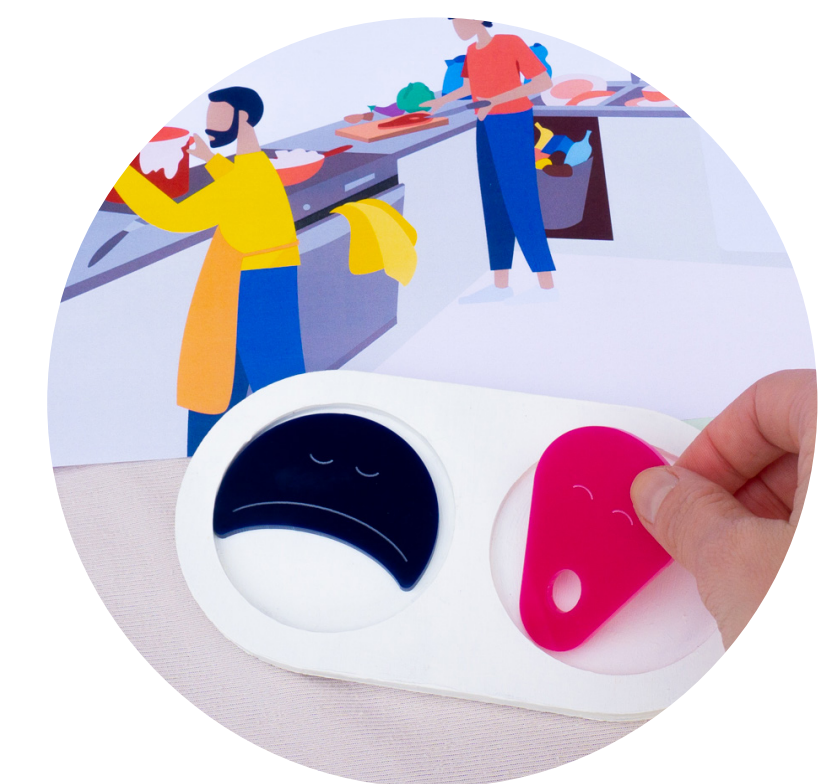
Reflect & explain emotion tokens