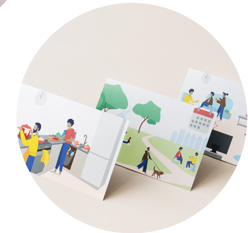
Choose & describe trigger card