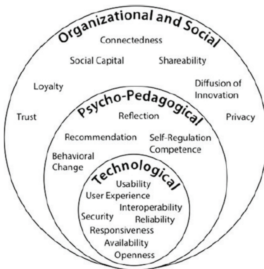
Figure 2: The “TOPS” integrated evaluation framework for PLEs

Case study 2 talks about Graasp (grasping resources, apps, activity spaces, and people), the social media tool used for collaborative learning. Graasp seems to be space focused, a main portion of multisensory learning. Graasp can be embedded into subspaces and allows subactivities, creating more freedom. It was helpful that the authors included images of Moodle and Graasp , however, it would be useful to include student’s reactions to Graasp .