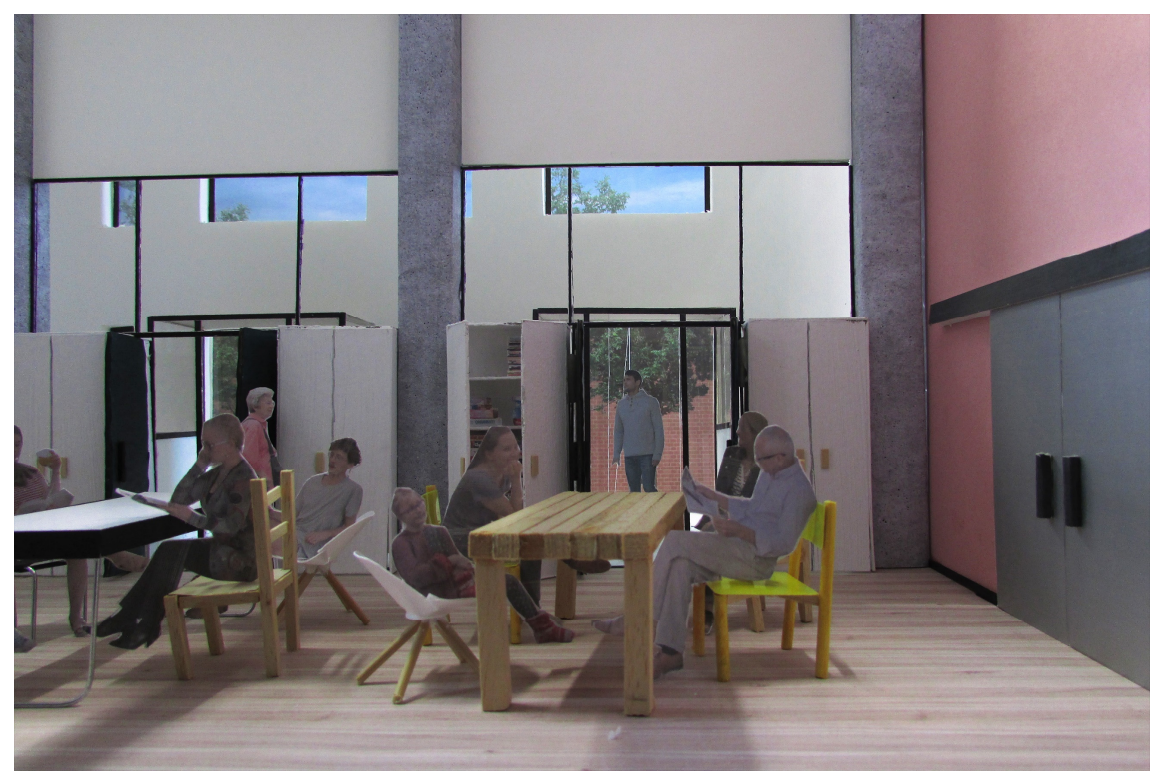
Fig 3 Workshop Scenography