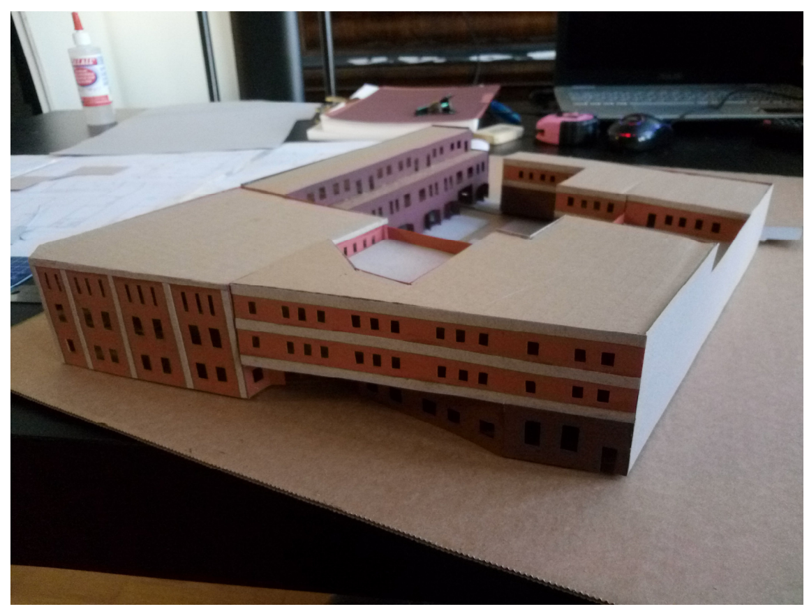
Fig 2 Model