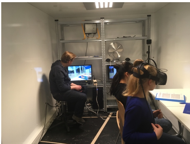
Figure 1. The Thermal test chamber set-up.

During the SenseLab studies the thermal comfort test chamber of the SenseLab was used as a virtual reality experiment to test the thermal comfort of a group of participating school children. In this experiment two primary school children took place behind a school desk per test run, sitting next to each other and wearing VR headsets (see Figure 1). The VR experience took place in a virtual classroom (see Figure 2), that was made in Unreal Engine 4, using two HTC Vive VR headsets.