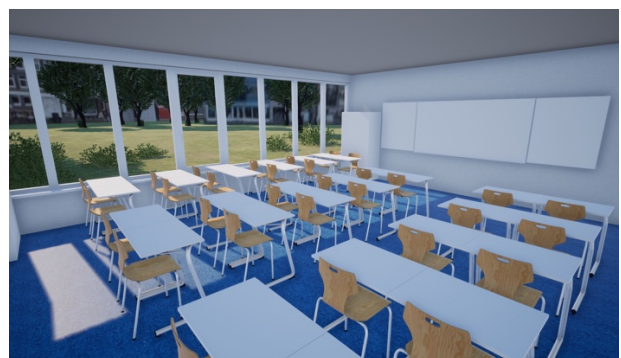
Figure 2. Virtual classroom with blue flooring and white walls.

In order to make a realistic experience the actual school desk and chair were recreated in 3D and placed in the virtual model. By aligning the physical desk with the VR desk, the participants could actually touch and feel the furniture while wearing their VR headset, giving them an increased sense of immersion.