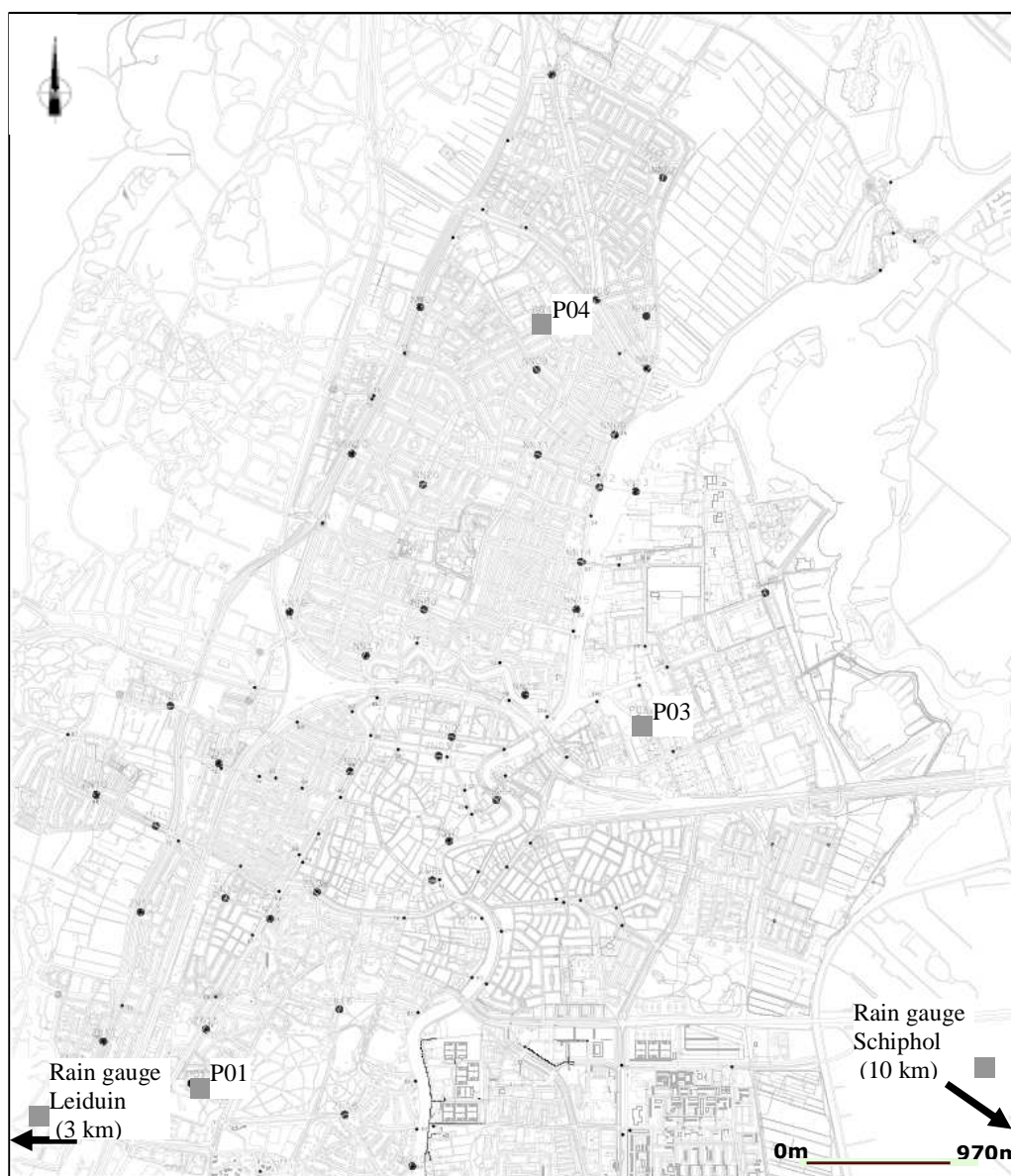
Figure 1 Map of Haarlem that shows the location of the rain gauges P01, P03 and P04 within the city area and the approximate location of the rain gauges Leiduin and Schiphol