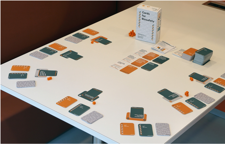
Fig. 1. Impression of the serious game Cards for Biosafety (TU Delft Gamelab, 2021)