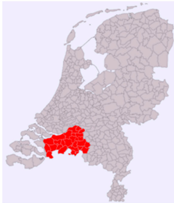
Figure 1. Location of the West-Brabant region within the confines of the Netherlands. (URL: https://nl.wikipedia.org/wiki/Politie_Midden_en_West-Brabant#/media/Bestand:Politie_Midden_en_West_Brabant_(Nederland_gemeenten_2009).png ).

nineteen municipalities (eighteen in the North-Brabant province, and one in the Zeeland province). Like many other regions WB contains a large urban center—the City of Breda (with roughly 182,000 inhabitants)—and a rural periphery that consists of many small- and medium-sized localities. The region also has a regional administrative body, ‘Regio West-Brabant’ (RWB), in which the nineteen municipalities collaborate, and jointly seek to foster regional socio-economic development (See Figure 1 for the location of West-Brabant within the Netherlands).