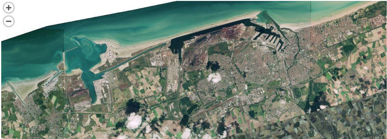
Figure 1. Aerial picture of the port region of Dunkirk in 2015, still with the city of Gravelines on the eastern border, and its nuclear power plant right next to the new LNG terminal area of Dunkirk 17 . The development of the port completely transformed the coastal landscape.

management of the port and its relation to the city and the region of Dunkirk. The port started to grow on the west side, away from the urban area and its citizens, to create bigger infrastructure, and keep pollution and other port-related problems away from residents (Figure 1). Although at the same time, the port and the city were growing in separate zones, with diverging and also overlapping interests.