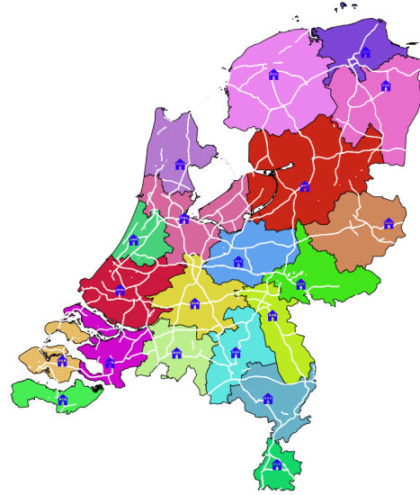
Figure 3: Overlay of Dutch road network, sited facilities, and allocated demand areas.

In order to prove that the facilities have been sited at places with good accessibility, we have overlaid the result of our proposed model on the road network of the Netherlands. Figure 3 clearly shows that the location of facilities and allocated demand areas generated by TpM are placed across major road arteries.