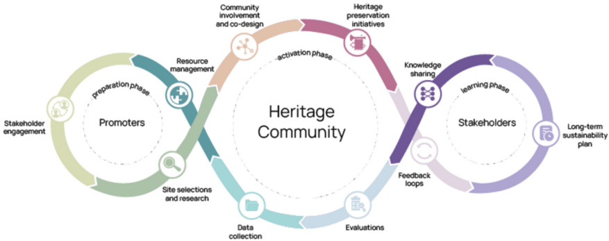
Fig. 3. Phases and steps of the Heritage Community Urban Living Lab (HeCo-ULL) (authors' elaboration).