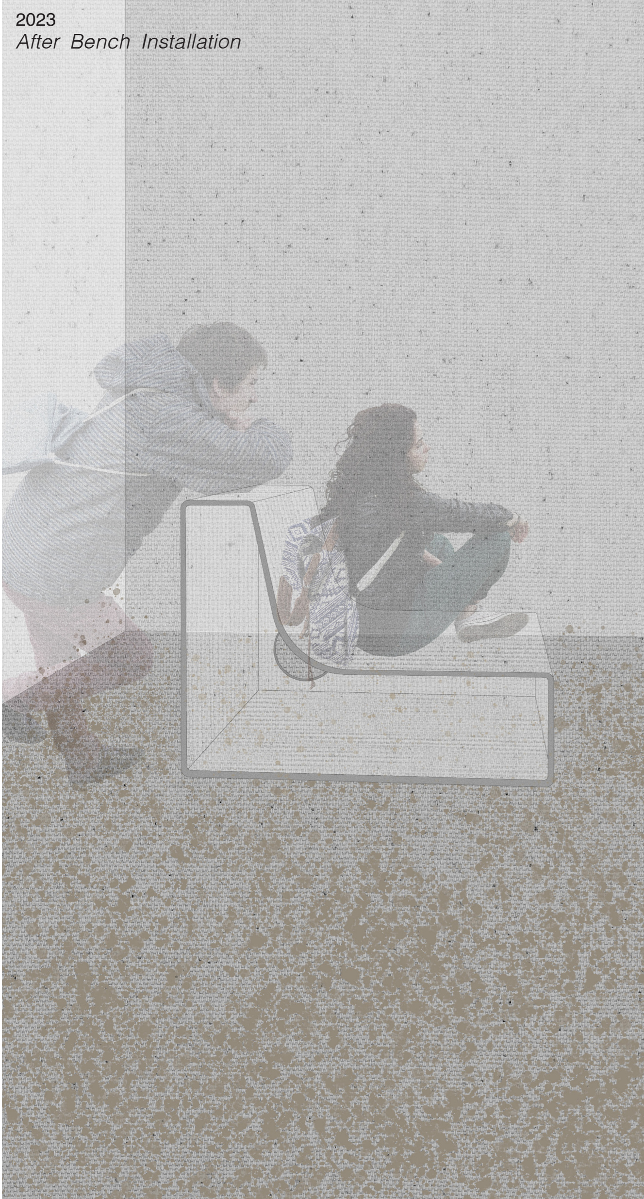
2023 After Bench Installation