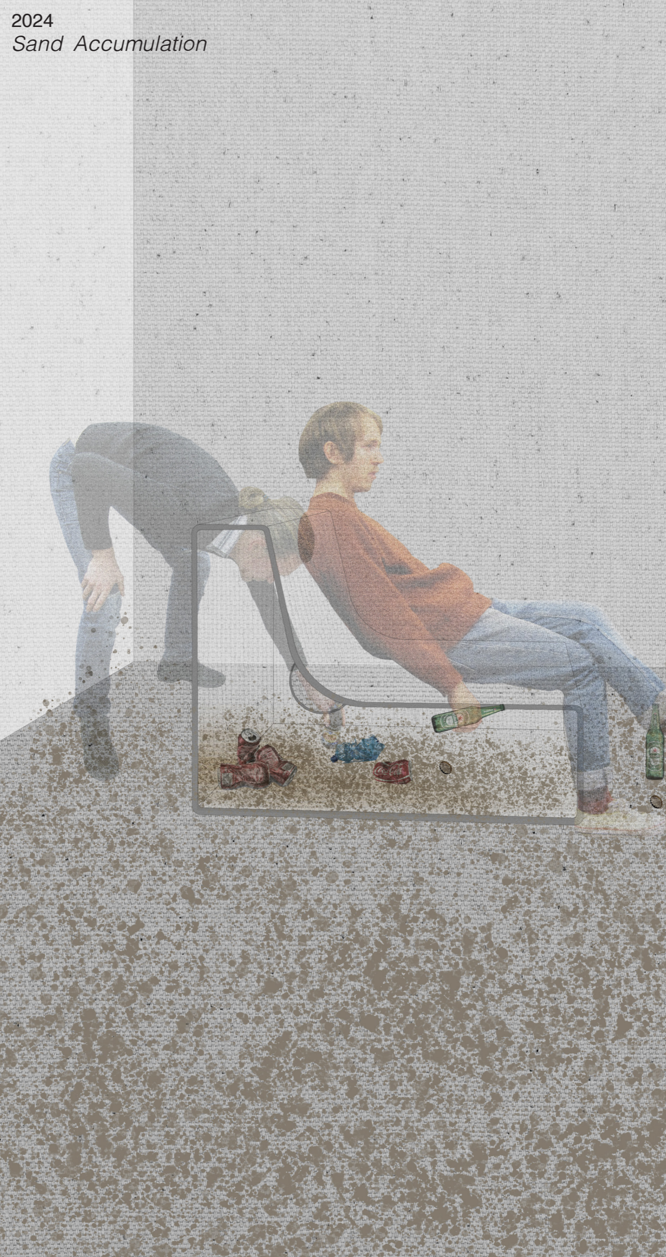
2024 Sand Accumulation