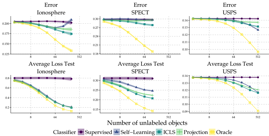
Fig. 2 Learning curves in terms of classification errors ( top ) and quadratic loss ( bottom ) on the test set for increasing numbers of unlabeled data on three illustrative datasets. The lines indicate average errors respectively losses on the test set, averaged over 1000 repeats. The shaded bars indicate \pm 2 standard errors around the mean

less conservative projection (ICLS) does show some improvement in terms of classification error.