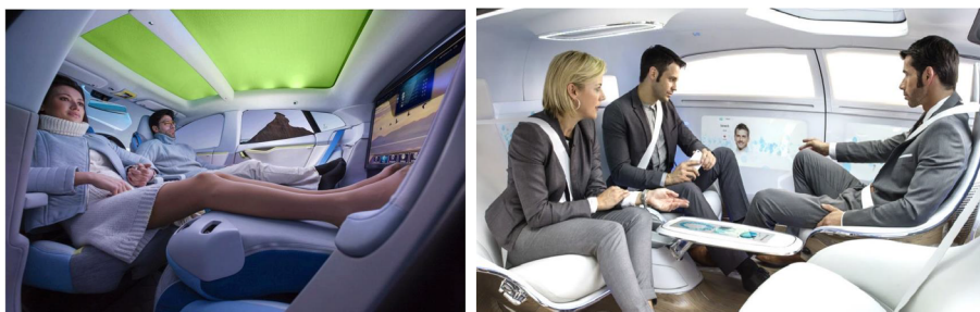
Fig. 3. Depiction of leisure interior (left) and office interior (right).