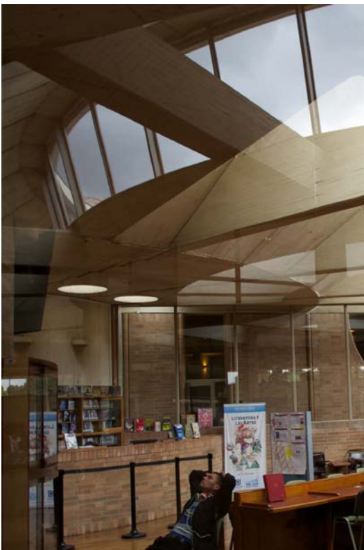
Figure 14. Rogelio Salmona, Virgilio Barco Library, reflections: the reading room. (Photo by Sebastiaan Veldhuisen, 2016)