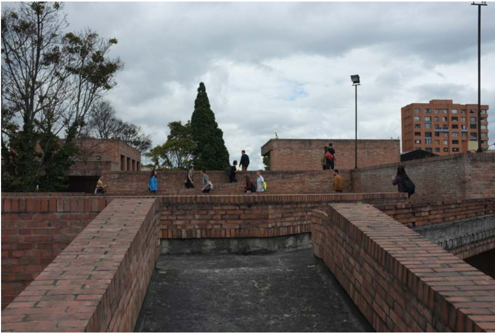
Figure 5. Rogelio Salmona, Centro Gaitán, crossing the building obliquely.