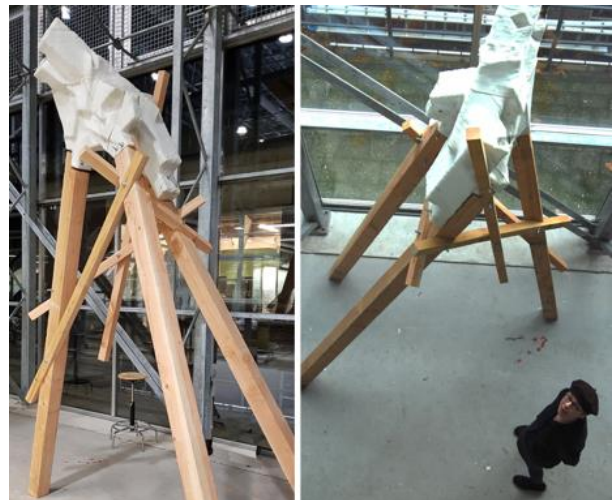
Figure 1. Prototype of the hybrid structure built in laboratory conditions

The developed 1:1 prototype (Figure 1) is a 3.30 m high fragment of a larger structure and consists of variously sized wood elements (linear members and panels) that are milled according to functional, structural, and acoustic requirements and a 3D printed polymer node. The employed D2RP&A approach builds up on knowledge and know-how developed at Robotic Building (RB) Delft University of Technology (DUT) since 2014 [1]. It combines off-site additive and subtractive D2RP with on-site human-robot D2RA (Figure 2) and the challenge has been the integration of various D2RP&A techniques.