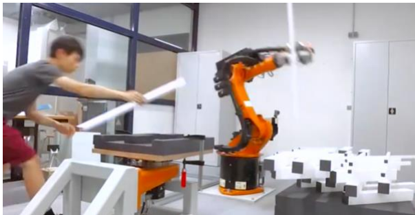
Figure 5. Huma-robot stacking of linear elements tested in lab conditions

The proposed D2RP&A approach is still work in progress, and the proof of concept presented in this paper has been implemented using various mapping, modeling, simulating, and prototyping techniques that identified challenges that need to be tackled.