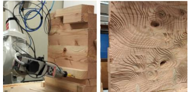
Figure 4. Panels with integrated acoustic and structural performance robotically produced at AUAS

the different wavelengths, when compared to the dimensions of the surface textures. Furthermore, conducting physical measurements is paramount for determining the absorption and scattering coefficients locally, based on local surface details.