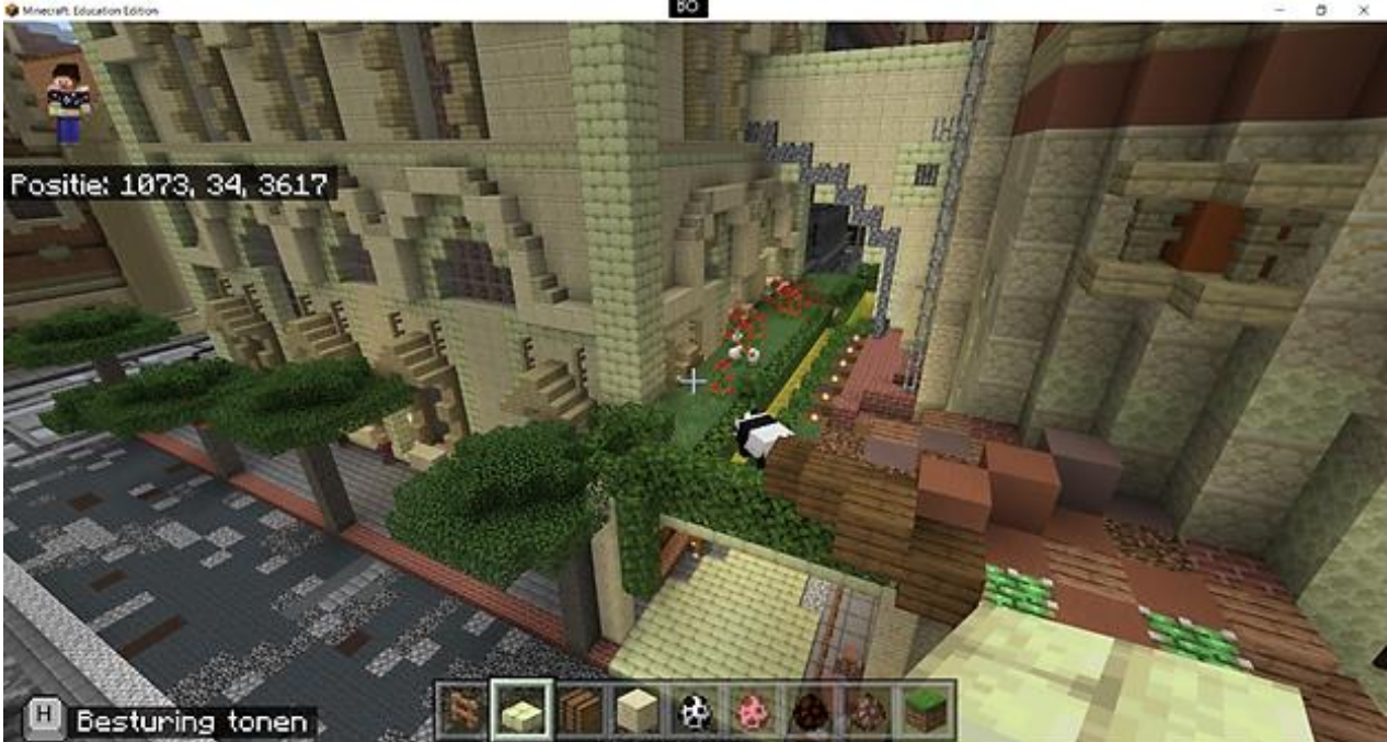
Fig. 2. Example of design intervention articulating values and attributes.

rated 46%. Most designs proposed greening streets and making them car-free zones. Some students proposed to bring back old uses such as a local marketplace. Some found the tool useful for initial design stages that do not require detailing. Others echoed that it is very blocky and not realistic. One student wrote down that “it is visually engaging and easy to change things in, creating easy consensus between a designing and commissioning group” (Fig. 2).