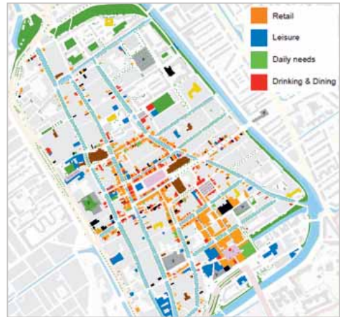
Urban functions and facilities in the city Centre of Delft

We found many positive critical factors in the city centre of Delft. For example, the Grote Markt demonstrates a busy public square rich in sensory experience, transparent plinths, and vertical façade rhythms. It is a busy square, especially on market days every Thursday. Furthermore, different activities and functions such as shops and leisure can be found. In summertime a lot of terraces can be witnessed in front of the cafes. Events like fairs, military shows and weddings in the historic City Hall can be seen here as well (opposite page).