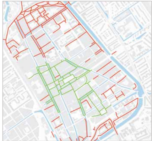
Synthesis map of used (green lines) and non-used (red lines) streets by all pedestrians