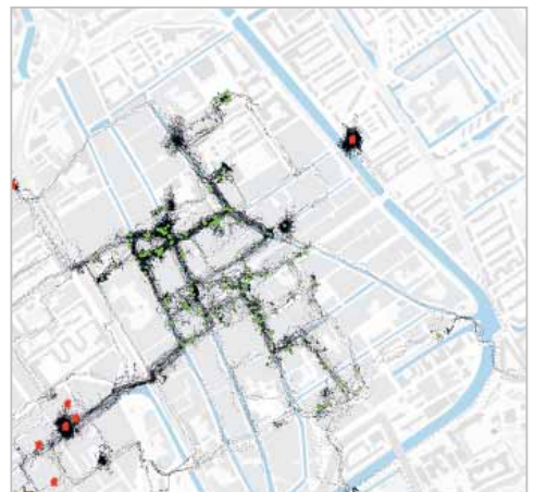
Pedestrian trips and destinations of neighbourhood residents