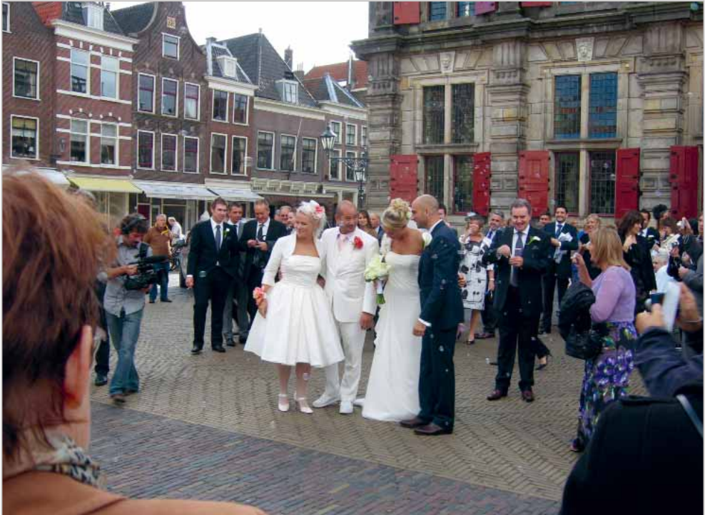
Positive factors of the Grote Markt square (top: market day; below: a wedding)