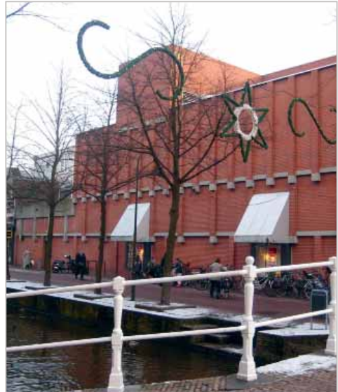
Negative examples of Delft's city centre plinths: Kruisstraat (left) and Molslaan (right)