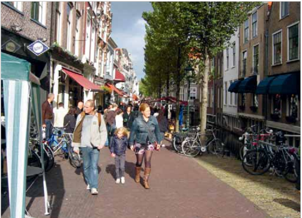
Positive examples of Delft plinths: Vrouwjutenland (top) and Voldersgracht (below)