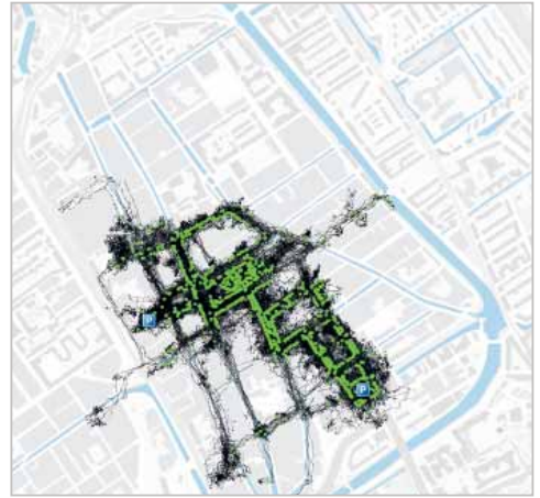
Pedestrian trips and destinations of visitors

Most destinations can, logically, be found in streets that belong to the central shopping area. Consequently, streets which lack facilities, especially a linked