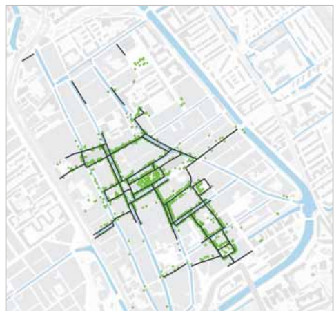
Destinations (green dots) and central shopping area with other streets that contain urban functions (black lines)