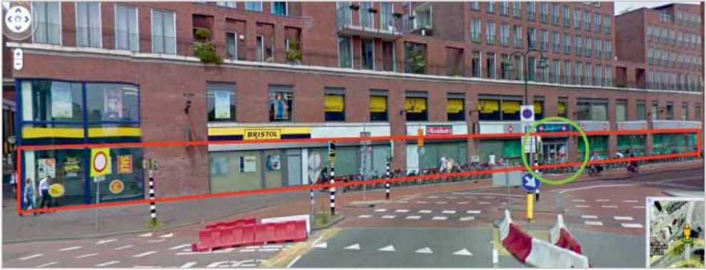
Negative example of Delft city centre plinths: Ezelsveldlaan