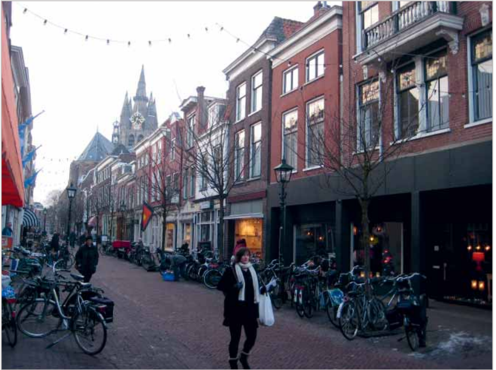
Positive examples of Delft plinths: Choorstraat

Other attractive streets can be seen here. Details are designed for a 5 km/h scale, windows are transparent, facades are interactive (appealing to many senses), streets are rich in sensory experience, there is a great diversity of functions and vertical façade rhythms appear.