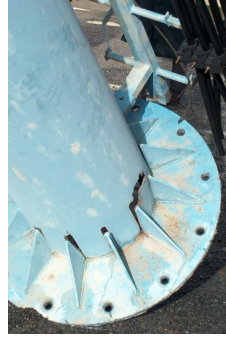
Fig. 2. Detail of the rupture at mid-height

On August 29, 2005, Hurricane Katrina struck the United States Gulf Coast and caused catastrophic damage to the combined telecommunications and power infrastructure. Devastating effects on both infrastructures hampered rescue efforts, blocked attempts to coordinate early responses, and made calls for aid impossible from the hardest-hit areas [28], [29]. White House Katrina Report described the results: “The complete devastation of the communications infrastructure left responders without a reliable network to use for coordinating emergency response operations” [28]. While it is tempting to view a catastrophe such as Katrina as an once-in-a-lifetime event, doing so would be an exercise in wishful thinking. Eight months before Hurricane Katrina, on December 26, 2004, the Indian Ocean tsunami highlighted the heavy human cost of communications breakdown during extreme events. While seismic monitoring stations throughout the world detected the massive sub-sea earthquake that triggered the tsunami, a lack of procedures for communicating these warnings to governments and inadequate infrastructure in the regions at risk delayed the transmission of warnings. However, based on the successful evacuation of the handful of communities that did receive adequate warning through unofficial channels, it is clear that better communications could have saved thousands of lives.