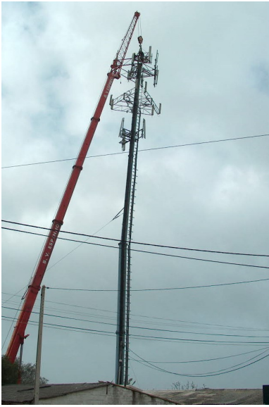
Fig. 1. Collapse of a 40-metre-high monopole